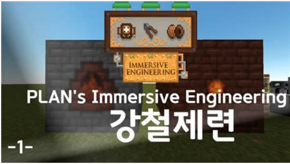
How to make a coke oven immersive engineering.